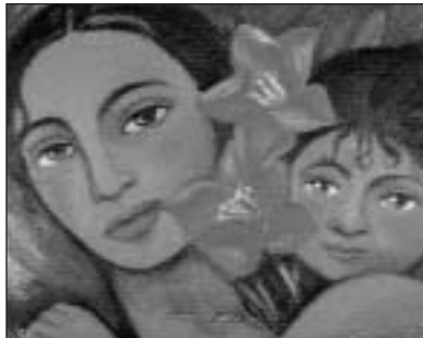
2001 MALDEF Legal Services Award

Eastern District of Michigan cited the amicus brief in December in concluding that diversity is a compelling state interest and that the University's undergraduate admissions program is constitutional.